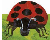
The Bad-Tempered Ladybird Eric Carle

Next week we will be continuing our investigation of the conditions that plants need to grow. We will examine the cress seeds we planted which have different variables (water, no water, light, no light) and look for differences between them. We will also begin to learn more about mini beasts and their features. We will be reading 'The bad tempered ladybird' by Eric Carle and lots of non-fiction books.