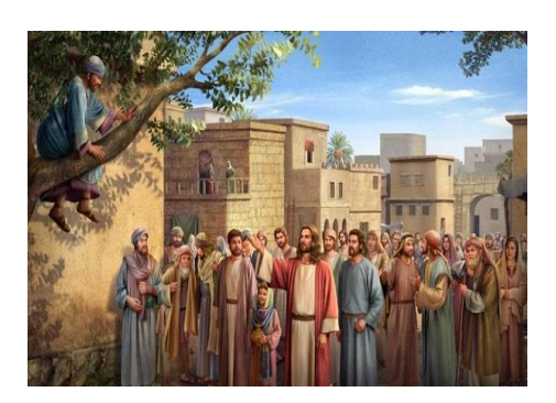
Luke 19: 5

When Jesus reached the spot, he looked up and said to him, "Zacchaeus, come down immediately. I must stay at your house today."