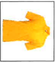
Yellow polo shirt with school logo – available to buy from office