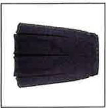
Dark grey school skirt