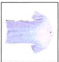
Plain white t-shirt, without logo