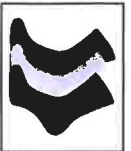
Plain grey, black or white socks or grey tights