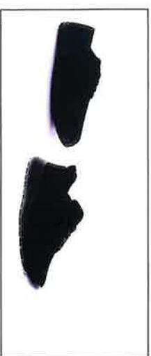
Plain black plimsolls or trainers, without logo

Children are expected to bring in a full PE kit every week.