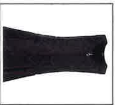
Dark grey pinafore dress