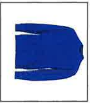
Royal blue sweatshirt with school logo – available to buy from office