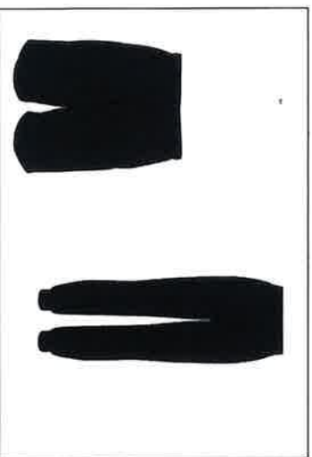
Plain black shorts or jogging bottoms, without logo