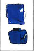
St Mark's book bag/rucksack – available to buy from the office